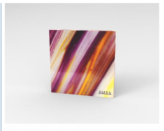
High aesthetic value higher qualityIndividually elegant minimalist design style